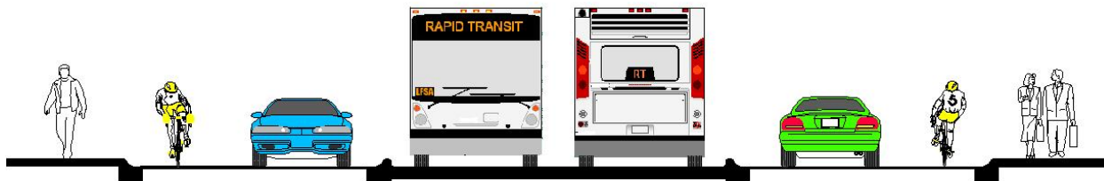
Figure 1: Typical Cross-Section for On-Road Rapid Transit Passageway

With both BRT and LRT options, the Grand River Transit bus system would be re-oriented with rapid transit as the backbone of the system. As shown in the route maps in Appendix B, the new bus system would include expanded local bus routes and a system of express routes, like the iXpress, either feeding into rapid transit or complementing rapid transit by offering a parallel service outside of the central transit corridor. There would be local service along the central transit corridor, serving additional stops in between the rapid transit stations. In addition, there would be inter-regional GO transit service connecting to the central transit corridor.